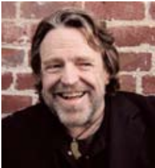
John Perry Barlow